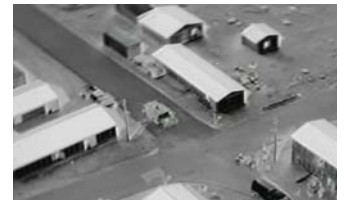
Downlink imagery from IR camera

Kizilirmak Mah. 1446. Cad. No: 12/18 Cukurambar 06530 Cankaya, Ankara / TURKEY Tel : +90 (312) 284 30 12 (PBX) Fax : +90 (312) 284 30 14 altoy@altoy.com.tr www.altoy.com.tr