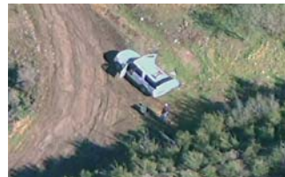
Downlink imagery from EO camera