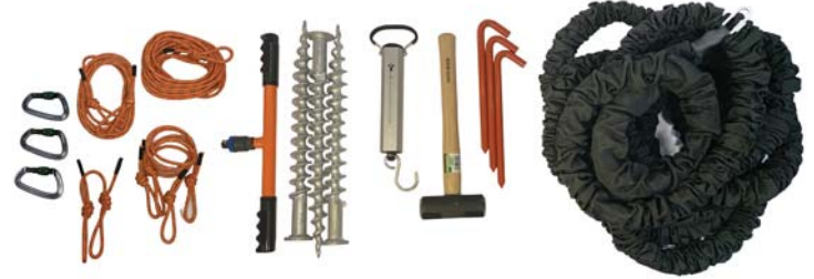
Bungee Launch System components