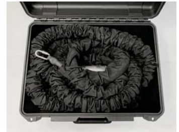
Packed Bungee Launch System