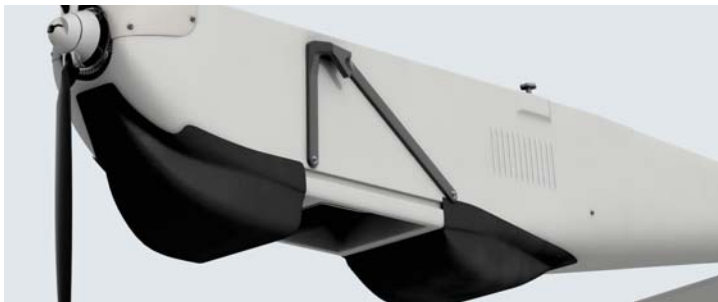
Puma™ 2 AE and Puma™ 3 AE mounting bracket