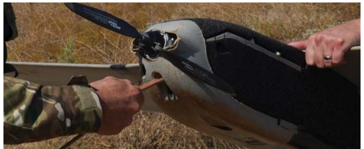
Puma™ LE mounting bracket

Kizilirmak Mah. 1446. Cad. No: 12/18 Cukurambar 06530 Cankaya, Ankara / TURKEY Tel : +90 (312) 284 30 12 (PBX) Fax : +90 (312) 284 30 14 altoy@altoy.com.tr www.altoy.com.tr